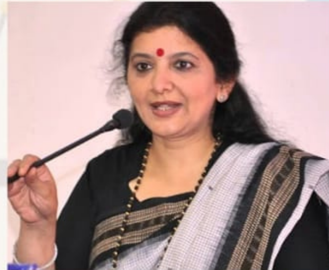
Advocate Monika Arora Supreme court of India