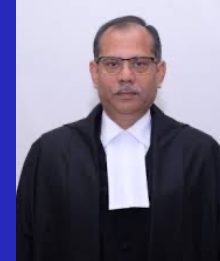
Justice A. K. Tyagi Judge, Punjab & Haryana High Court