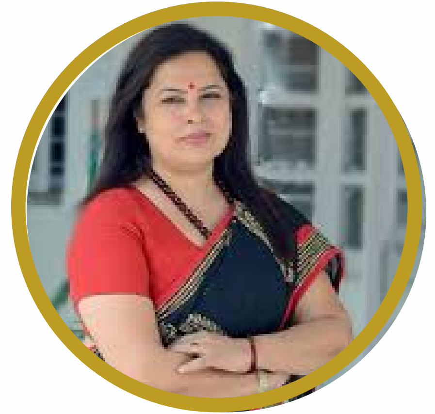
Chief Guest Ms. Meenakshi Lekhi Senior Advocate Former Minister of State for External Affairs Government of India